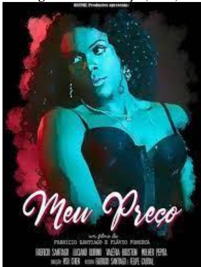
Figure 2: Meu Preço (2020)

Morena is a beautiful transvestite call girl who joins her transsexual friends for another night of routine and struggle for survival. However, when she encounters a new client, she brings her past to the surface in a violent and harrowing way."